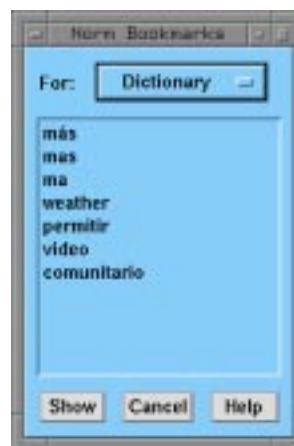
FIGURE 2. The OLEADA Bookmark Window

When using paper-based resources, translators will often make references back to information they have previously found. To accommodate this OLEADA has a 'Bookmark' feature that keeps a list of lexical items previously found. Figure 2 shows the interface for this feature.