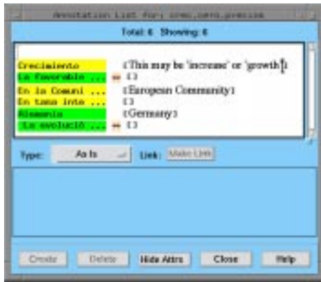
FIGURE 5. The Annotation List Window with Annotation Text