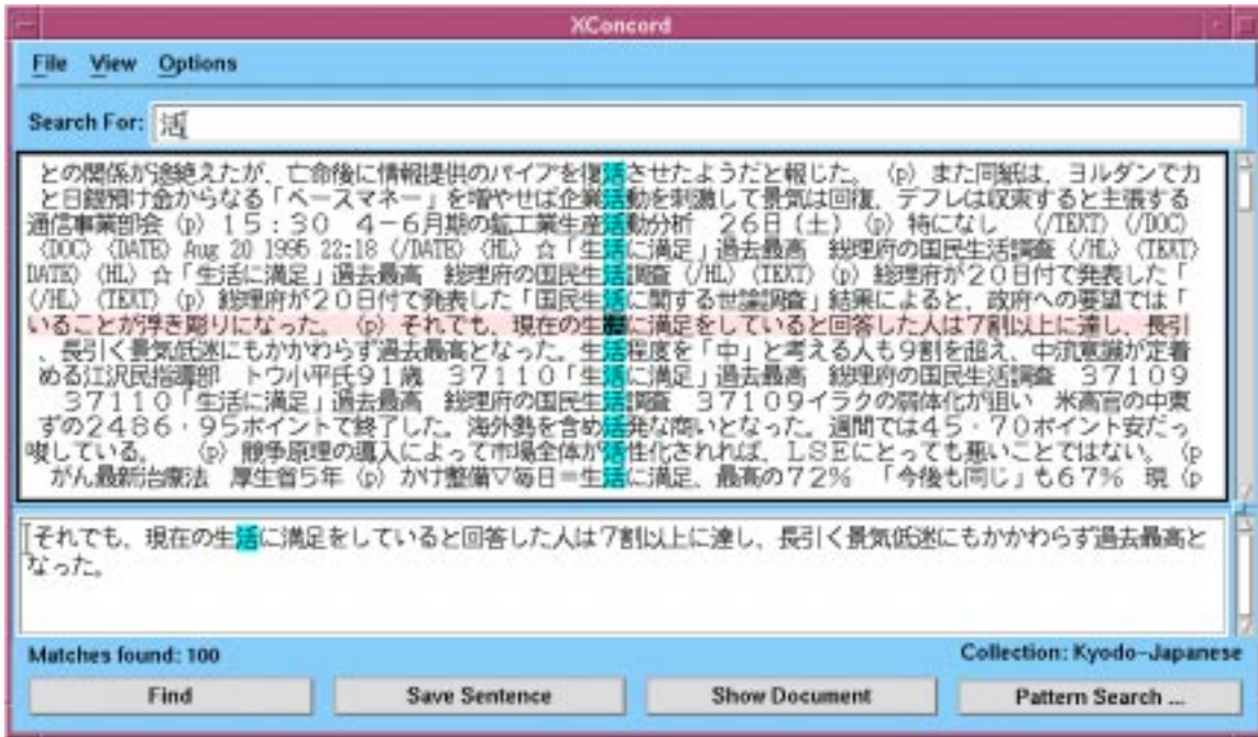
FIGURE 3. Xconcord Key Word in Context (KWIC) Window

plete documents to new text files are provided. The users can then edit these files or use Xconcord to print the results.